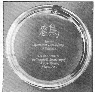
SILVER TRAY with the engraved Kanji character, Crane, signifying long life, was presented to Sony/Tek by Tek's Information Display Group.