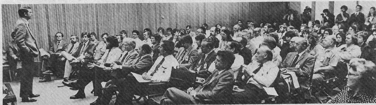
PRESIDENT EARL WANTLAND congratulates employees who had a part in the T465 cathode ray tube which reached a new milestone in January—the 250,000th tube.