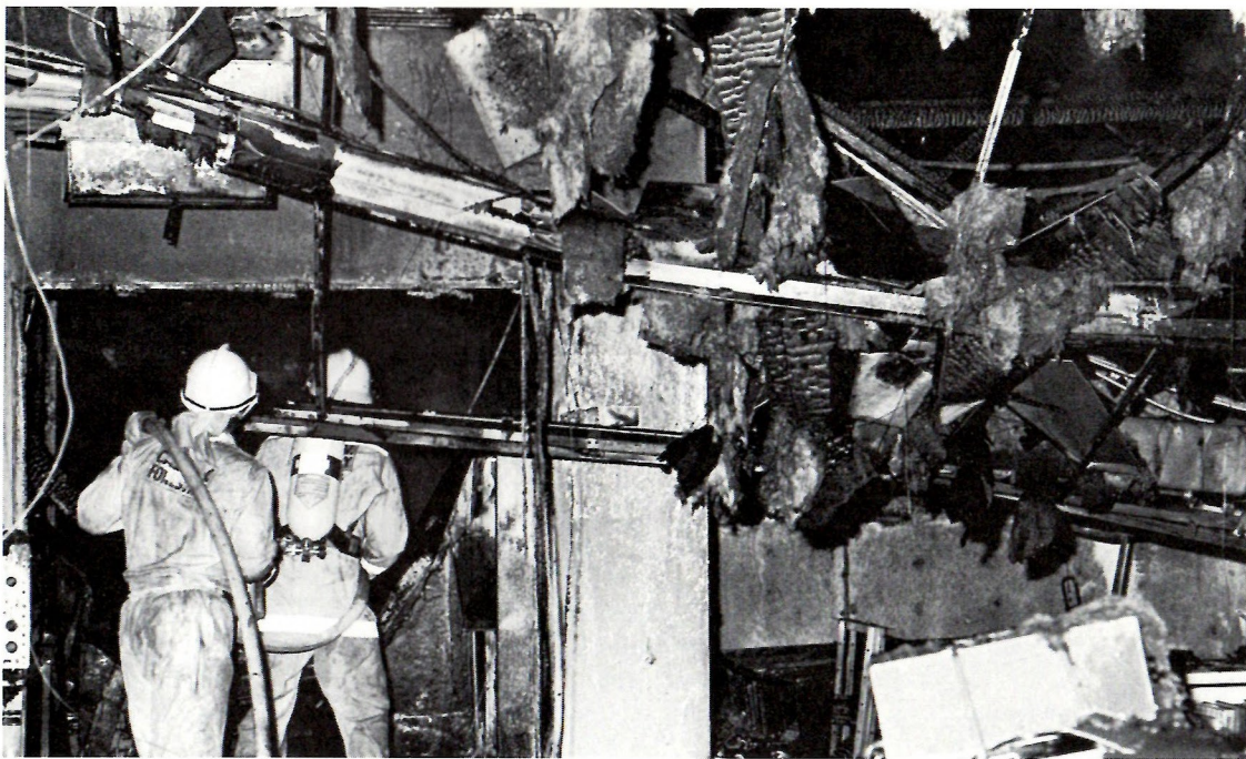
SOME 30 FIREFIGHTERS were called out at 1:45 a.m. August 3 to quell the blaze which destroyed Grass Valley Group's Administrative Office building.