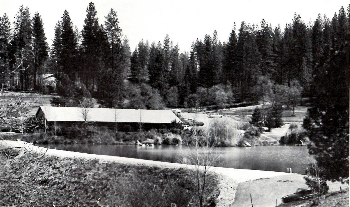
HERE'S HOW the GVC Administrative building looked before the destructive fire.