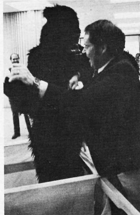
"we'll have somebody in a gorilla suit jump out of the box..."