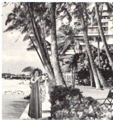
While the Northwest shivered ..... Our more fortunate friends moseyed around in Muu-Muus.