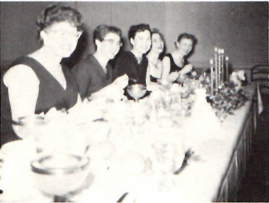
Everyone was happily consuming the Crab Cocktail at the Secretary's Xmas dinner when someone decided to snap them. An obliging group, No ?

"A JUG OF WINE, A LOAF OF BREAD, AND THOU BESIDE ME"..... at the Mallory Hotel on Friday, December 12th for the Office Worker's Christmas Dinner. This was the way it went when the gals got together in the Italian Room for their monthly fling.