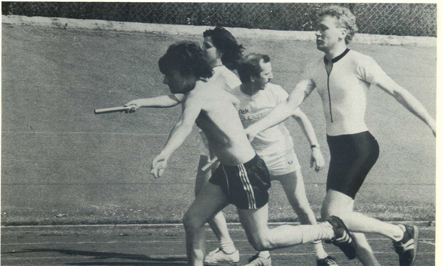
Grab the baton and run for your life! A mixture of arms and legs at a change-over point during the relay race.