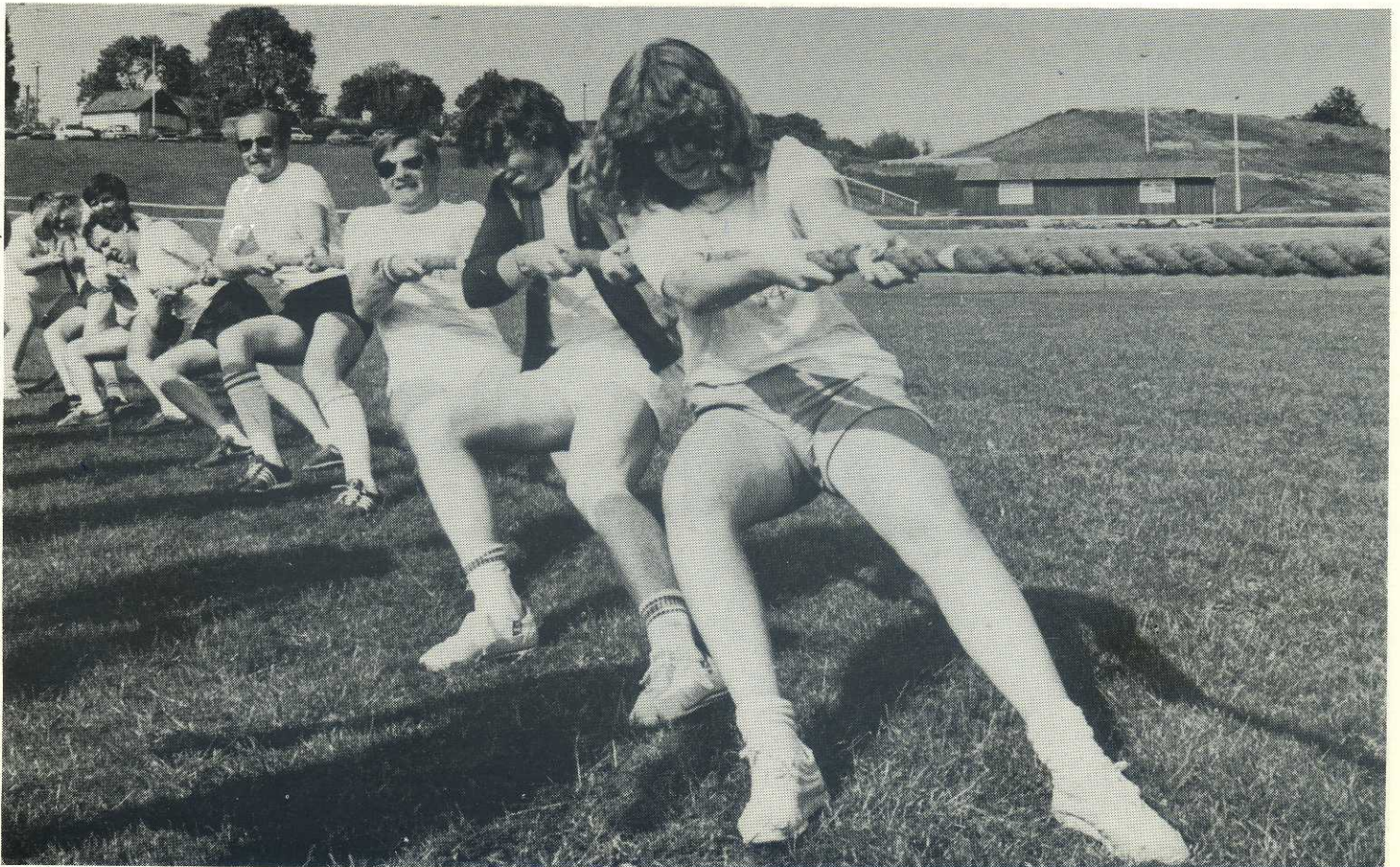
ALL TOGETHER NOW . . . . "One more tug and we'll do it". The Maidenhead team flex their muscles and give it every ounce they've got.