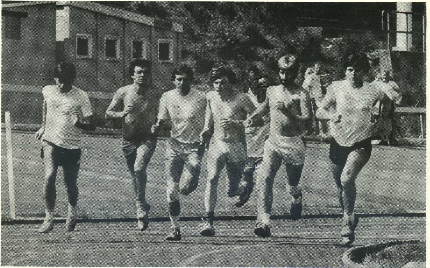
THEY'RE OFF! Determination etched on every face as the runners in the 400 metres race jockey for position.