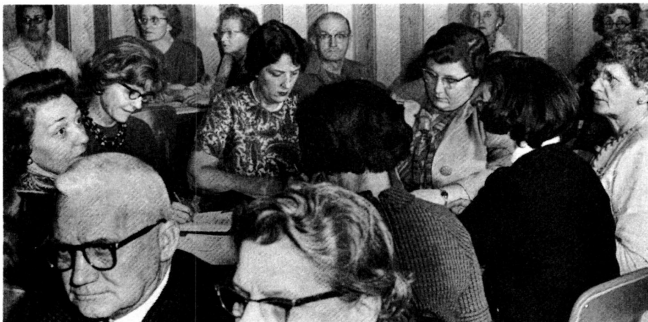
MORE THAN 150 members attended the 13th annual meeting of the Tektronix Employees' Credit Union in Assembly Cafeteria (45) on Thursday, January 20. A 4½ percent dividend was announced at the session.