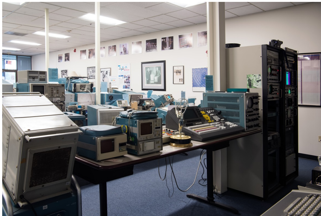
413 Neonatal Monitor