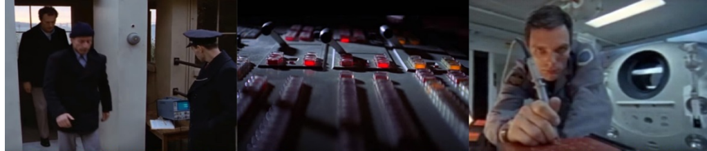
A sampling of some of the many Tektronix Products used in movies and shows