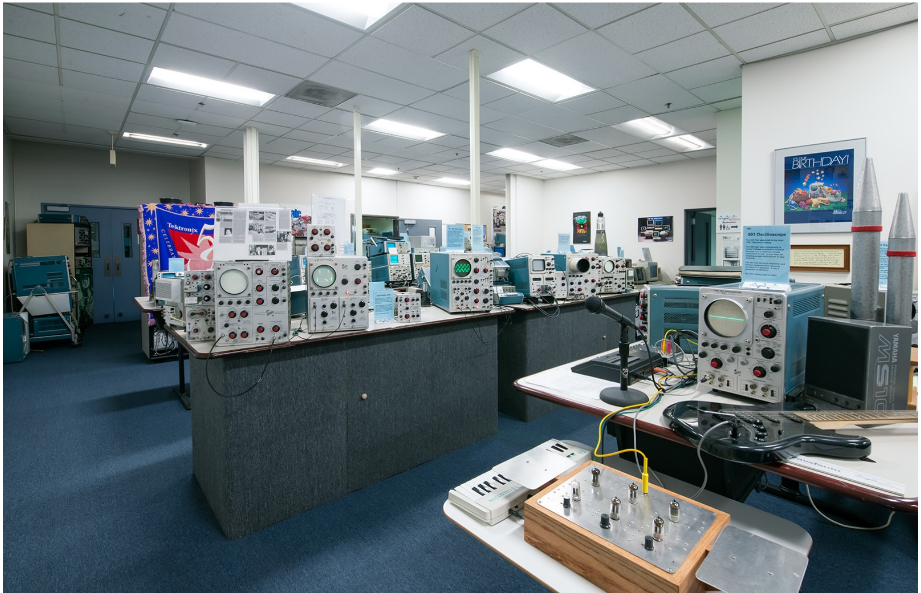
Wide-view image of the main showroom looking from the front Come visit the museum in person to explore the wonders