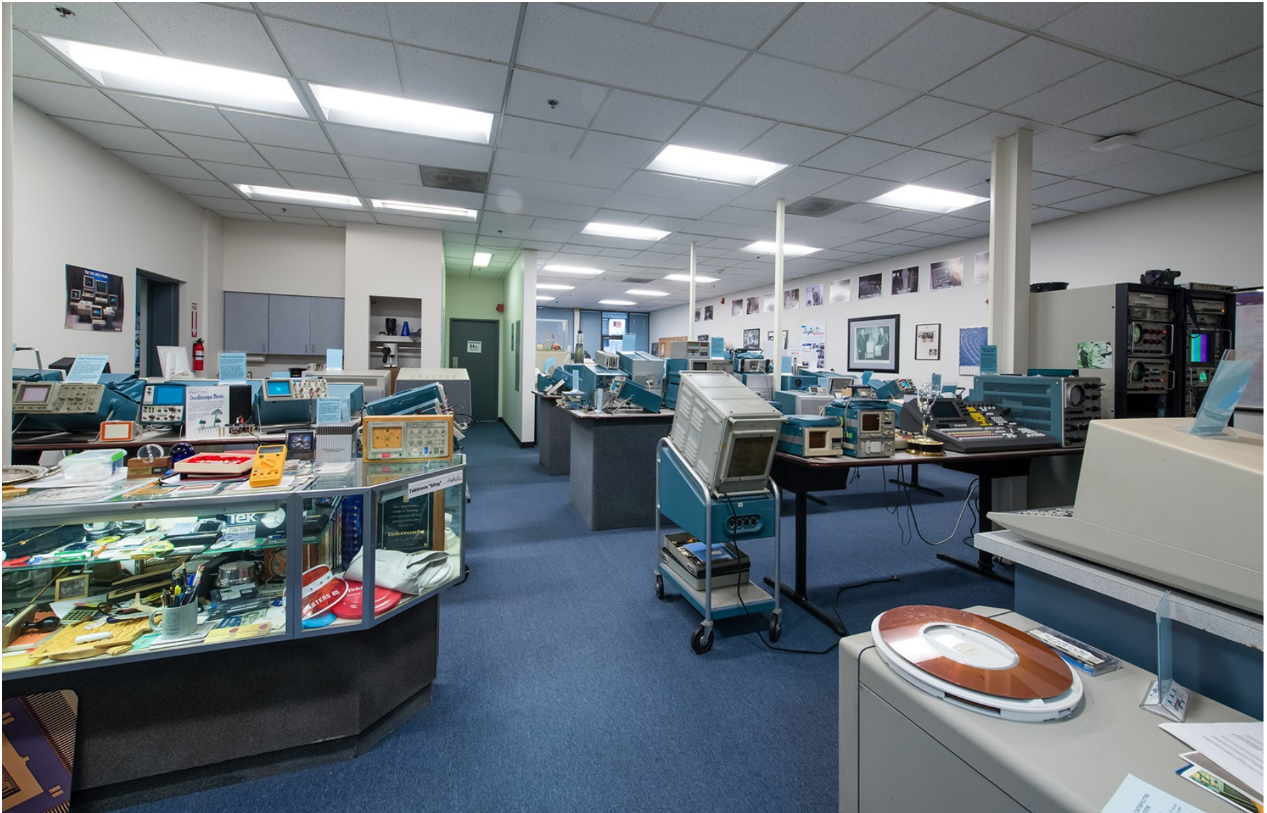
Wide-view image of the main showroom looking from the rear Visit the museum and the exhibits and more on the web at vintagetek.org