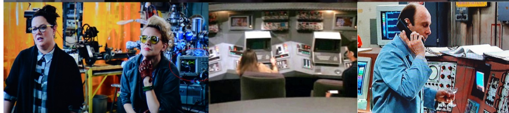
Left to Right, Top to Bottom